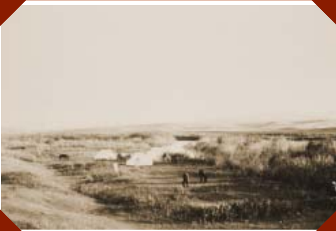
This 1890 photograph of Willow Creek is an image of health; woody vegetation is abundant and diverse.

Some of the changes to a landscape occur slowly, over periods of time beyond an individual's memory. Because of this, sometimes we fail to notice that change, even deterioration, has happened.