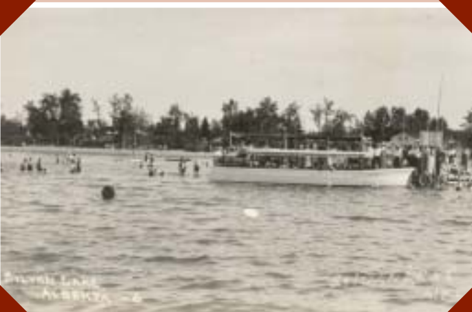
This 1920's photograph of Sylvan Lake is an image of health; the water was clear, clean and enjoyed by many.