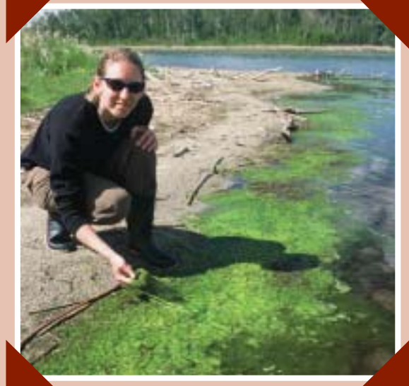
In recent times many central Alberta lakes show signs of water quality problems.

These changes may affect us, our lives, livelihood, health and recreation. When we begin to recognize riparian condition it is a start towards changing the trend from one of decline to stability and perhaps improvement in health. If you drink water, farm or ranch, have a lakeside cottage, swim, fish or watch birds, riparian area health is important to you. Riparian areas make up a small portion of the landscape, but are much more important to us than their small size would indicate.