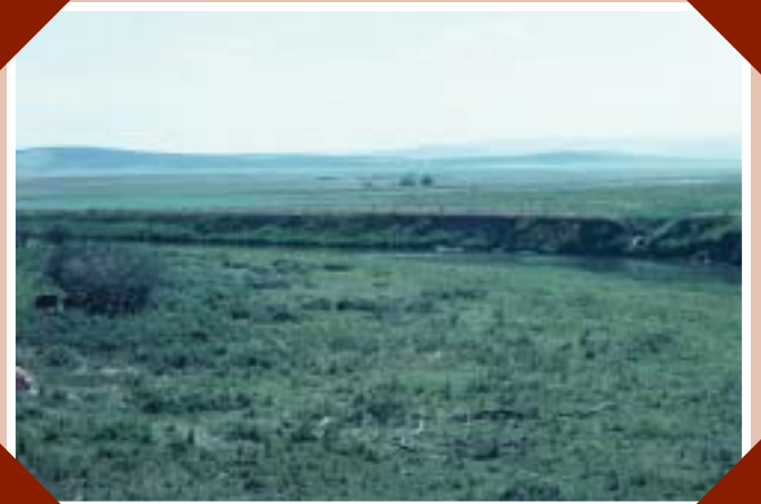
Almost 100 years later, this same site on Willow Creek shows substantial change, although some remnant woody species still persist.