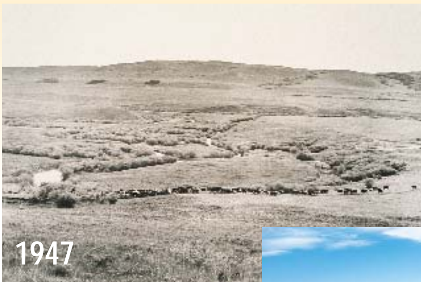
A mid-1940s view of a stream in the foothills of southwestern Alberta shows extensive willow growth in the riparian area, stable banks and a narrow channel with a willow canopy.