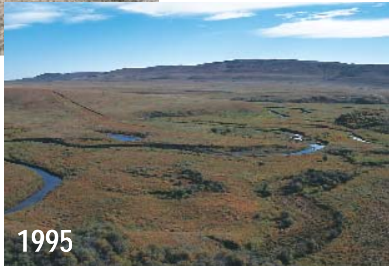
Fifty years later there are a few remnant willows and a wider channel with unstable streambanks.

We may tend to think of the products of riparian areas as forage for livestock and wildlife, shelter for livestock and ourselves and fish for angling, but the key element is water. Concerns about water will focus attention on the watersheds that produce this vital resource and on the uses that occur in those watersheds. Intact watersheds with healthy riparian areas will provide downstream water users with acceptable water quality. Those downstream users, including our urban neighbours, might also think about where their water comes from and how to help those that manage the watershed.