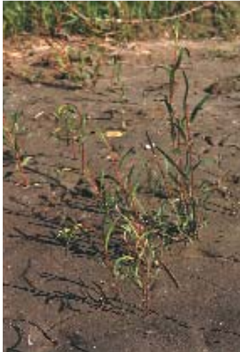
Woody seedlings like this willow plant, will establish under deferred grazing, but may be grazed out during the dormant season. Rest-rotation helps to add this critical woody component to your riparian area.

When it's critical to restore woody vegetation in riparian areas, a more conservative grazing strategy like rest-rotation grazing may be necessary.