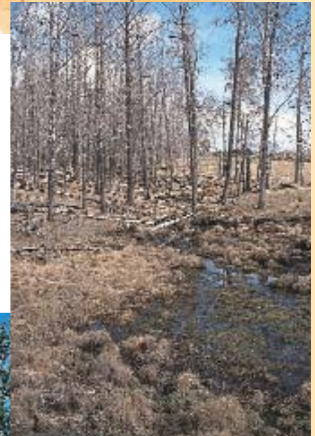
This riparian area shows no regeneration of woody plants and will require rest-rotation grazing to establish them. Livestock can be managed to allow plants to return and reach a grazing resistant stage.