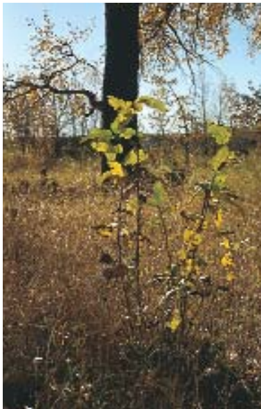
This cottonwood sapling has established itself but is not yet resistant to livestock use.