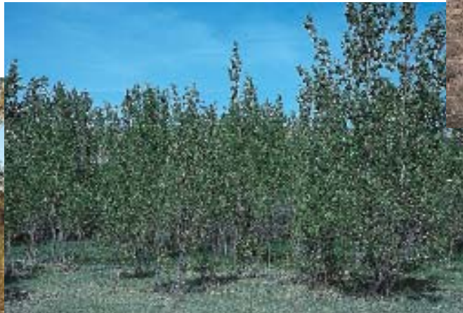
These cottonwoods have reached a grazing resistant pole stage and the riparian area can absorb grazing pressure. Monitoring is key to ensure this vital component of the riparian area is maintained.

Tiny seedlings to tall trees grow - If we let them!